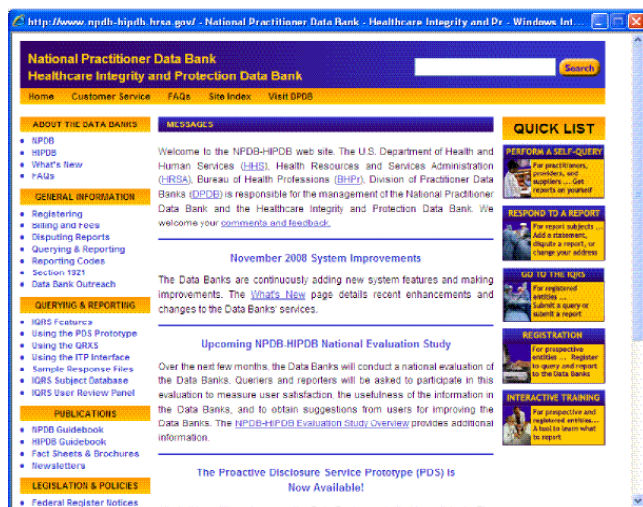
Figure 1. NPDB-HIPDB Home Page

If you wish to register, click the Registration icon on the NPDB-HIPDB home page (Figure 1). If you are already a registered entity and wish to update your registration, you may do so using the Integrated Querying and Reporting Service (IQRS), available from the NPDB-HIPDB Web site.