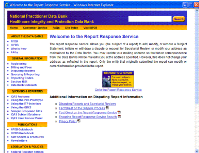
Figure 1. Welcome to the Report Response Service Screen Correcting Report Information Using the Report Response Service

user security, Notifications of a Report in the Data Bank(s) sent after December 9, 2002, contain a unique password for access to the Report Response Service.